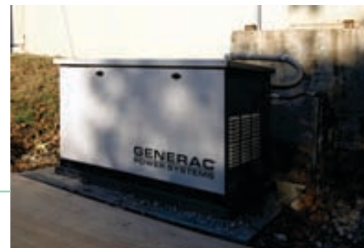
GENERATOR BACKUP FOR COMMON LIGHTING.