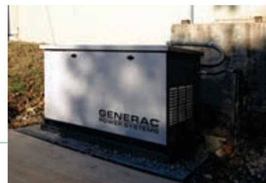
GENERATOR BACKUP FOR COMMON LIGHTING.