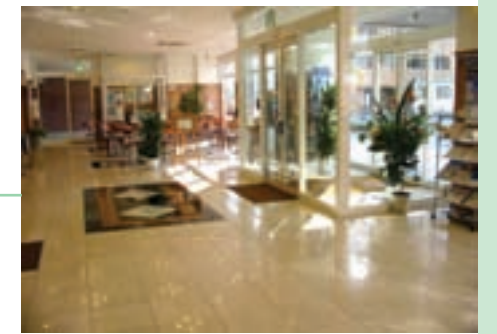
BEAUTIFULLY DESIGNED ENTRANCE LOBBY